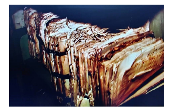
In a library at the Vatican there are fifty miles of shelving, housing classified documents

IT SEEMS THERE WERE A FEW FOLK OF EVERY NATION WHO'D MISSED THEIR RIDE TO THE FEAST; and perhaps—some of higher learning who had second thoughts as they neared the City of shining splendor and tarried upon distant mountains to observe the devil's operations. Many of these were geologists and scientists given a fresh respect for their King, and they wrote extensively regarding the events of those days; but their works have been hidden away in secrecy for hundreds of years.